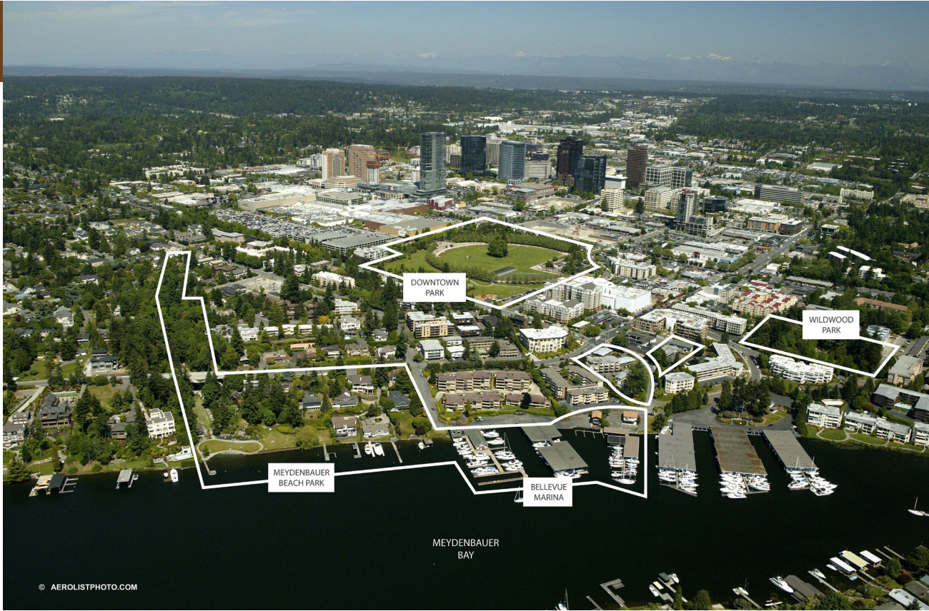
A Figure 6.1-1: Surrounding Context