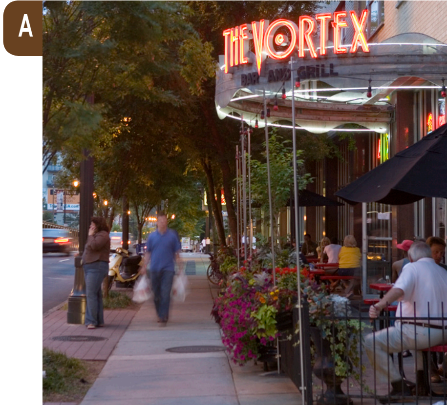
A Figure 6.1-2: Example of Active Streets (EDAW AECOM)